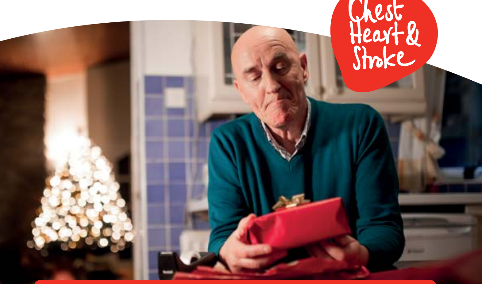
Texts will cost the donation amount plus one standard network rate message, and you'll be opting into hearing more from us. If you'd like to donate without opting in, use LITTLENOINFO when texting. Charity Reg No. NIC 103593